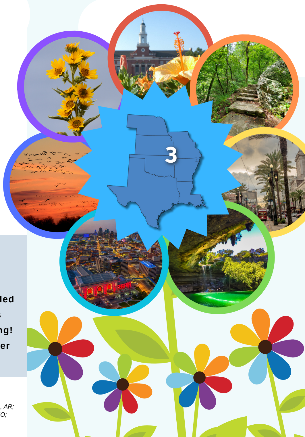
Pictured clockwise from top: Stillwater, OK; Hot Springs, AR; New Orleans, LA; Travis County, TX; Kansas City, MO; Platte River, NE; Fort Hays, KS