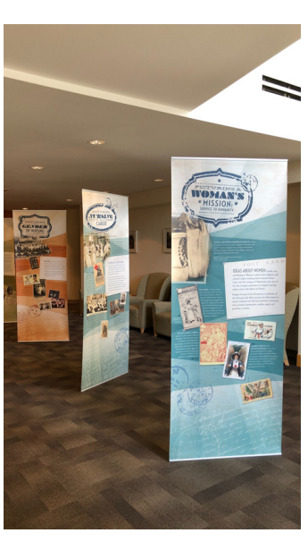
Submitted by Holly Hubenschmidt